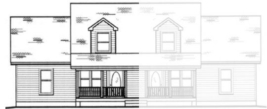
This model is one side of a duplex.